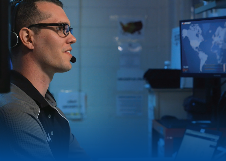
CHART A COURSE FOR GROWTH AND SUCCESS

We are proud to serve as a constant, vigilant beacon for one of the world's most innovative, inventive and industrious business sectors on the planet – regardless of size, longevity, specialization or future ambition.